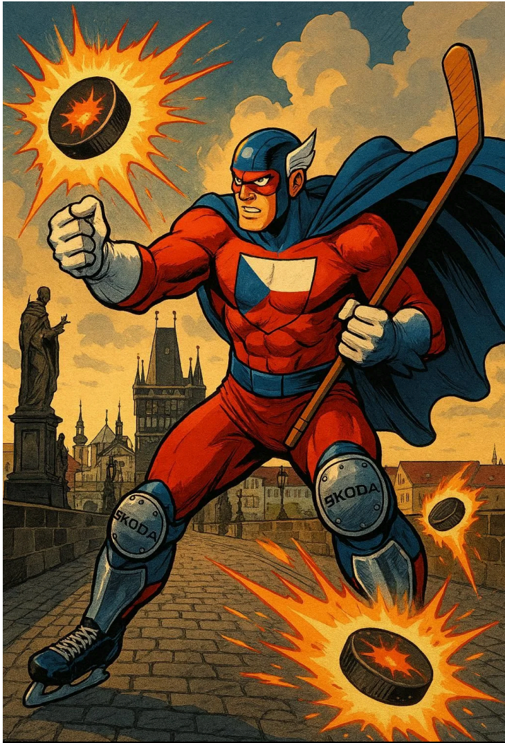
WHAT CZECH REPUBLIC'D BE AS A SUPERHERO EXPLOSIVE PUCK