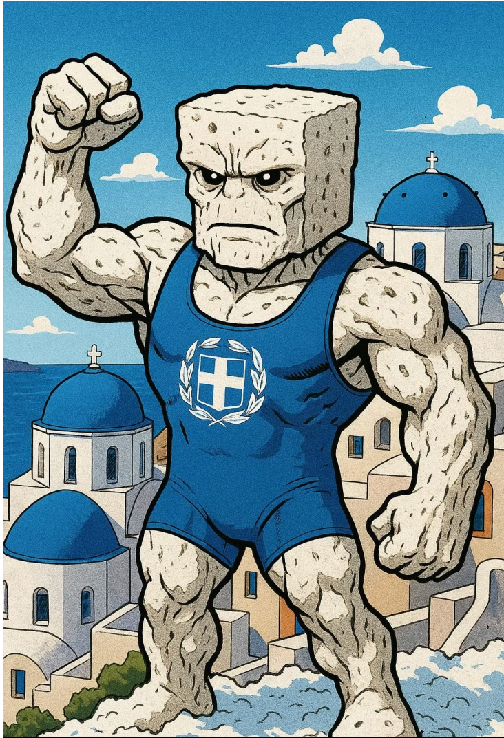
WHAT GREECE'D BE AS A SUPERHERO FETALIMPIC