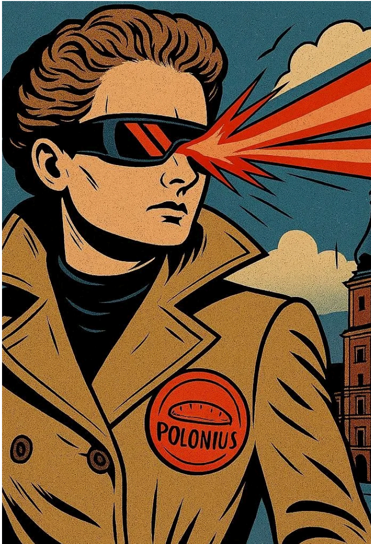
WHAT POLAND'D BE AS A SUPERHERO MADAME PIEROGI