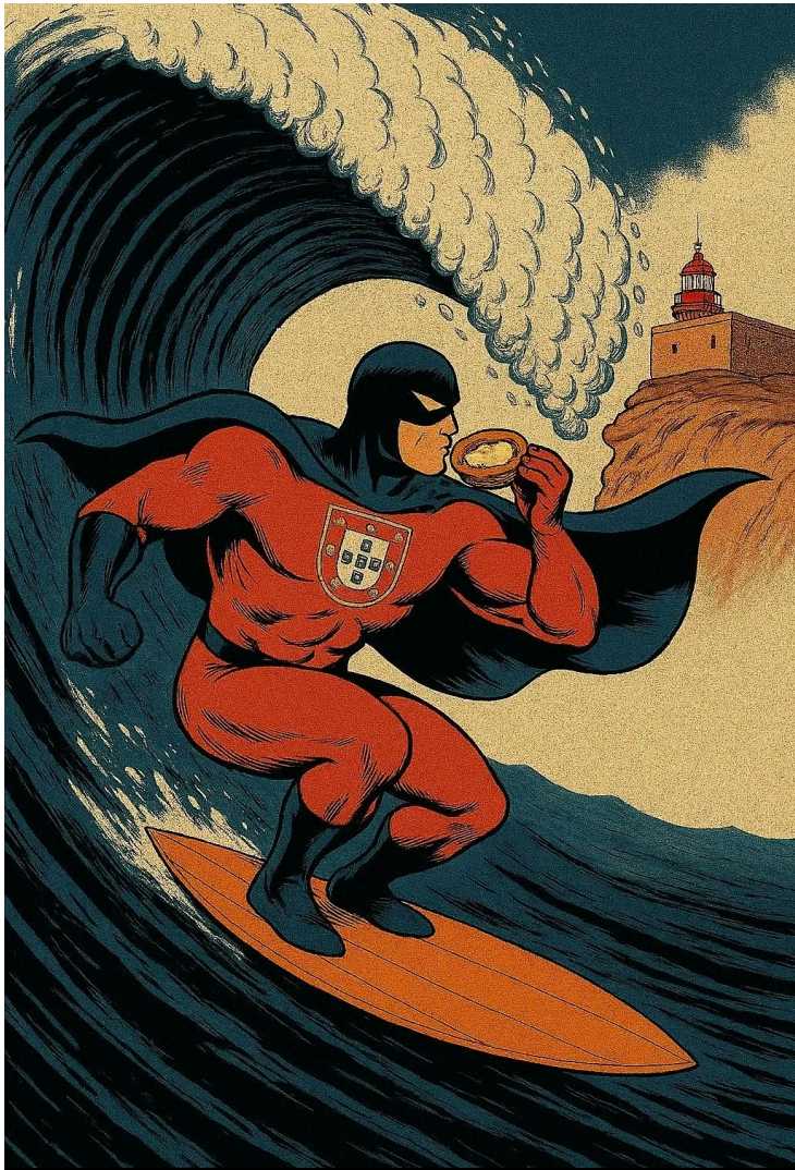
WHAT PORTUGAL'D BE AS A SUPERHERO XISTO SURFER