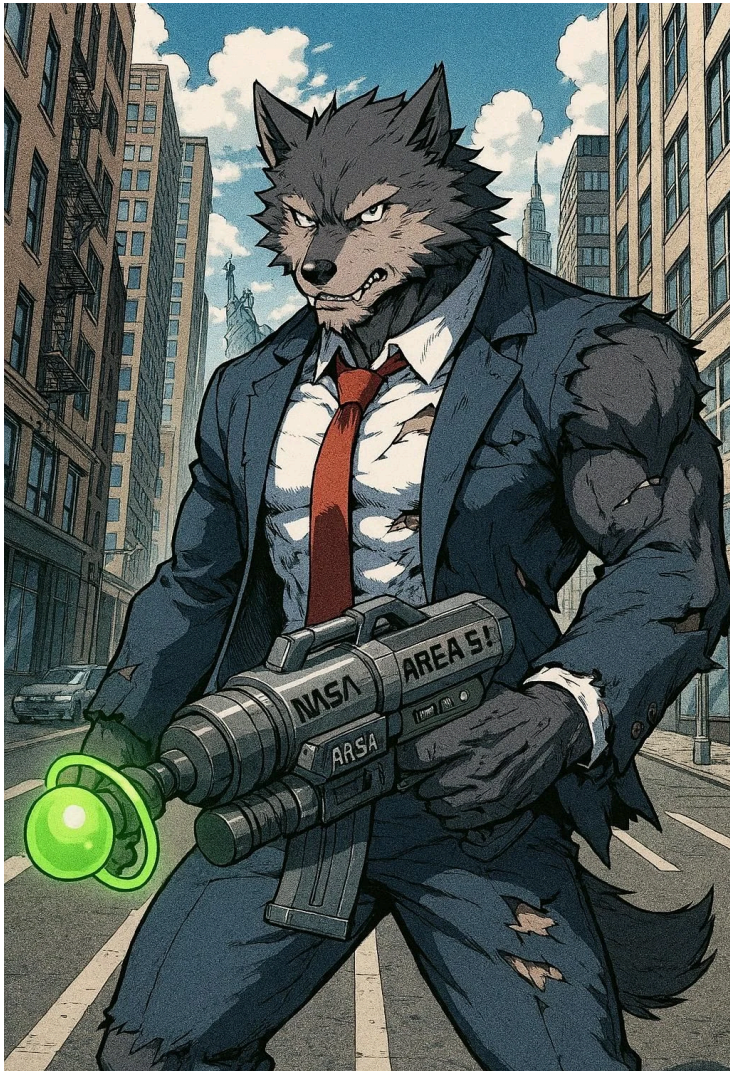
WHAT UNITED STATES'D BE AS A SUPERHERO WOLF OF W.S.